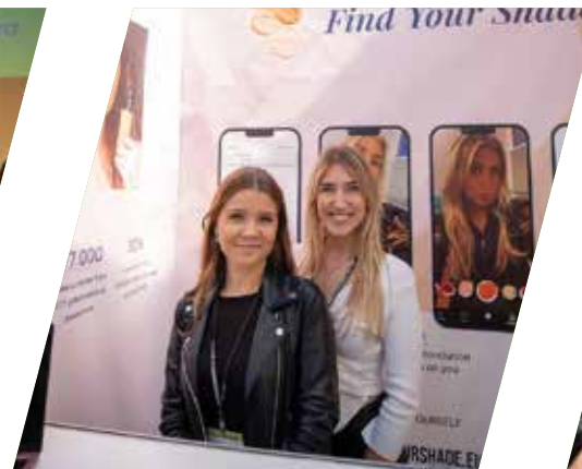
Find Your Shade Estonia