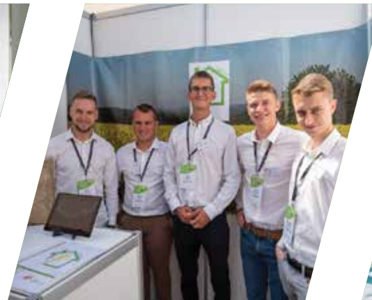
Colz'Iso Belgium FR