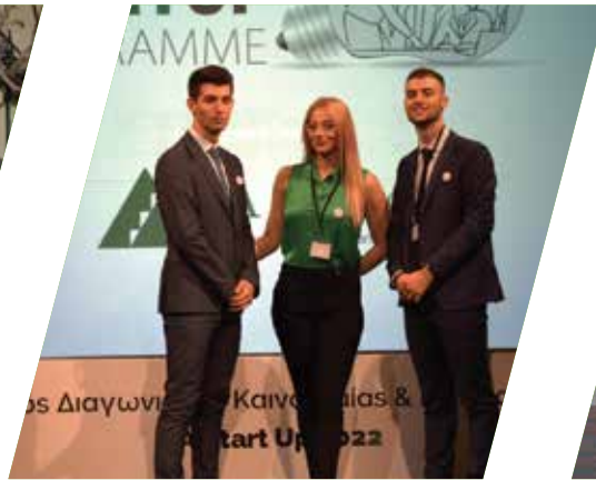
Drug n Drop Greece