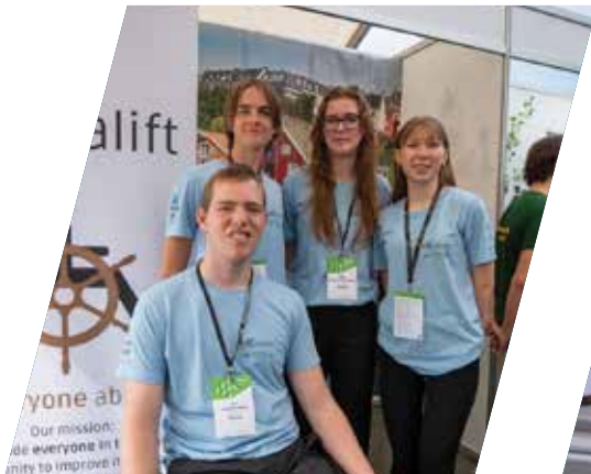
HC Sealift UB Norway