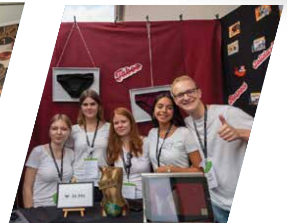
Don't Be Shy Belgium FR