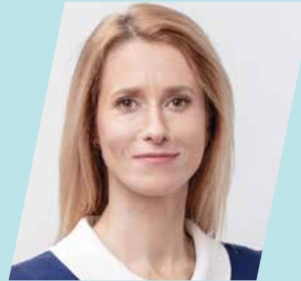
Kaja Kallas Prime Minister of Estonia