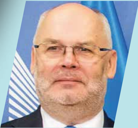
Alar Karis President of Estonia