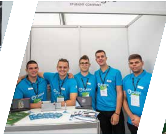
OBEX - JA Montenegro Montenegro