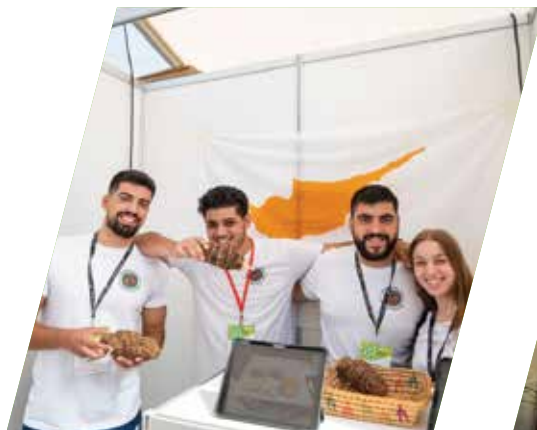
Kolokasi Delicacies Cyprus