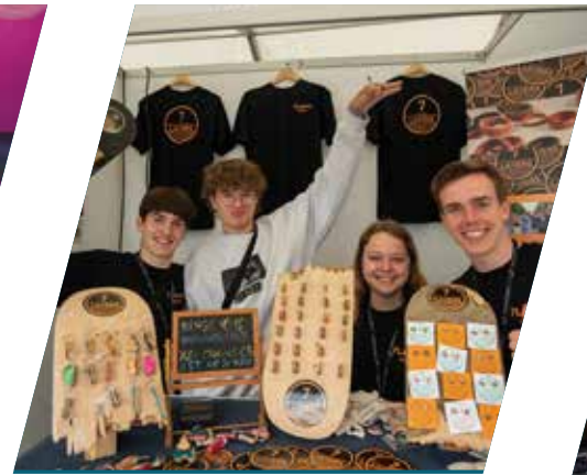
7Layers Belgium FL