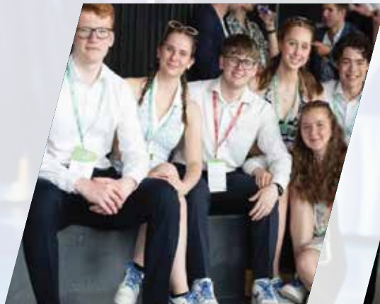
Atlas Isle of Man