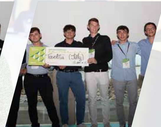
Tavolita JA Italy

Johnson&Johnson Brilliant STEM Innovation Award