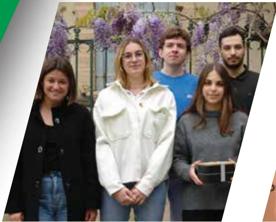
Go Bento France