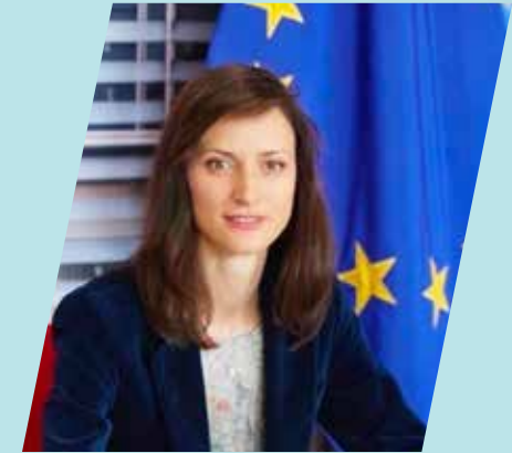
Mariya Gabriel EU Commissioner for Innovation, Research, Culture, Education and Youth