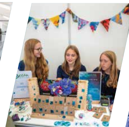
Ocean Revolution UK