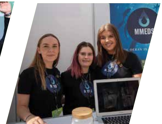
MMEDS SB Norway