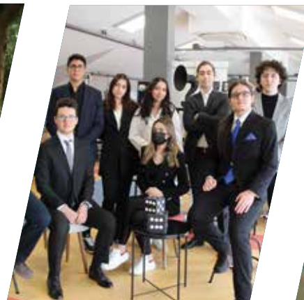
ADAXy Company Turkey