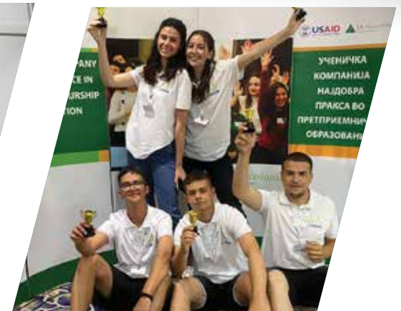
Beauty & Health North-Macedonia