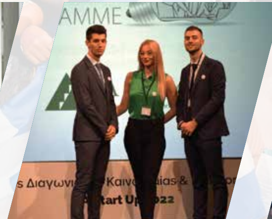
Drug n Drop Greece