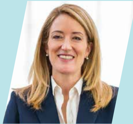
Roberta Metsola President of the European Parliament