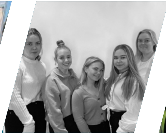
Gente UF Finland