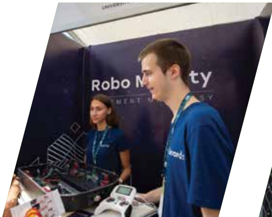
Robo Mobility Latvia