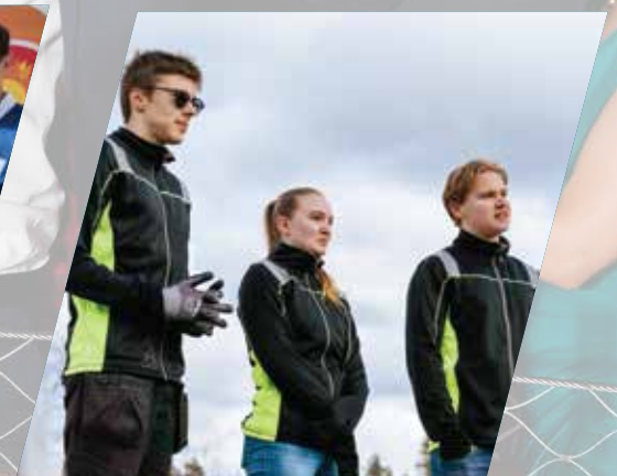
Noll Deponi Sweden