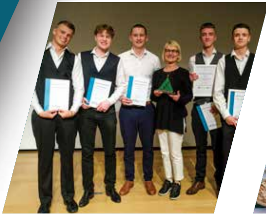
HAF vítamín Iceland