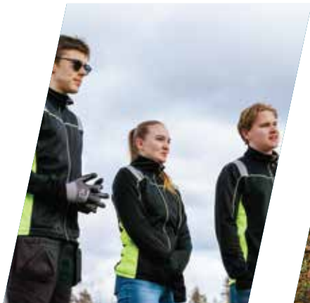
Noll Deponi UF Sweden