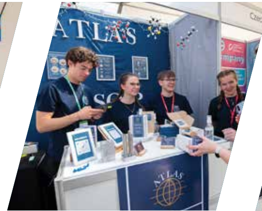
Atlas Isle of Man