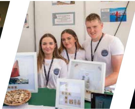
Frámaí Chonamara Ireland