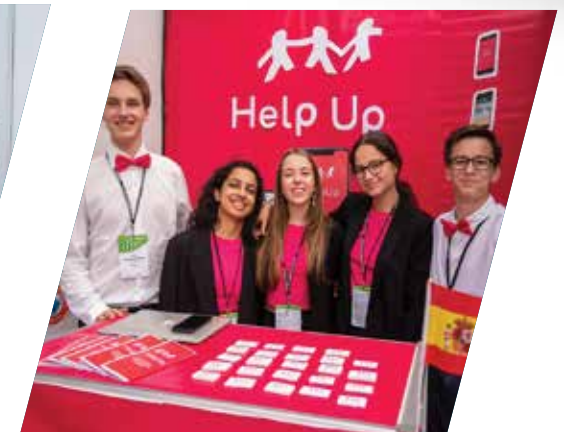
Help Up Spain