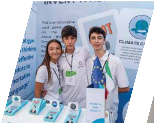
Eion Games Italy