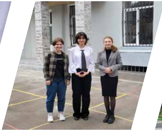
Royal Rafael Moldova