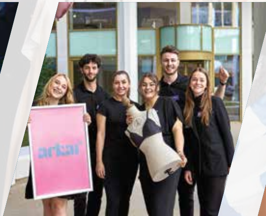
ARKAI Belgium FL