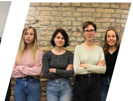
Parrot Pallet Hungary