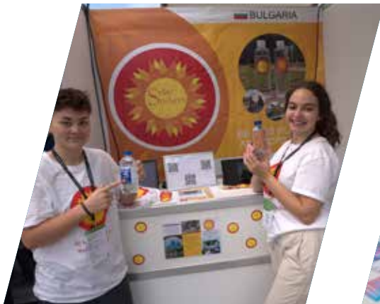
Solar Stickers Bulgaria