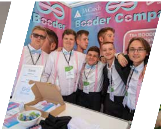
Booder Czech Republic