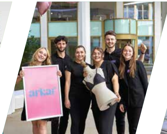
ARKAI Belgium FL